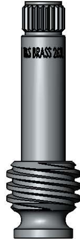
001908-25 Removable Eterna Spindle Insert w/ Check, LTC (1 Qty)

Product Specifications: Replacement Kit For B-1100 Workboard Faucet Spindles (RTC & LTC)